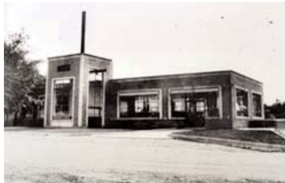
A photo taken in 1923 shows the exterior of Henry Ford's Phoenix factory, where women earned as much as the going rate for men.

Between 1919 and 1940, Henry Ford created 27 Village auto parts factories in Michigan farmland.